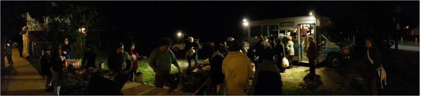
Servants offer food, clothing and the gospel at a nighttime outreach on Jefferson Avenue in southwest Rochester.