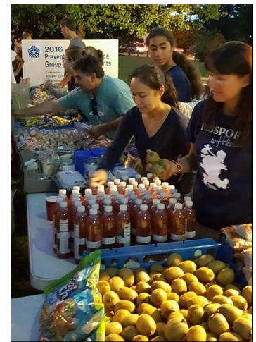
Servants set out plenty of fresh fruit and juice at West Main and Brown streets.