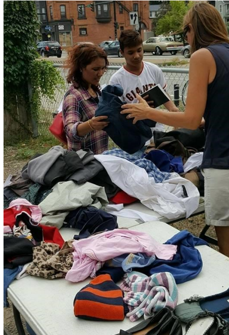
Free clothing is offered.