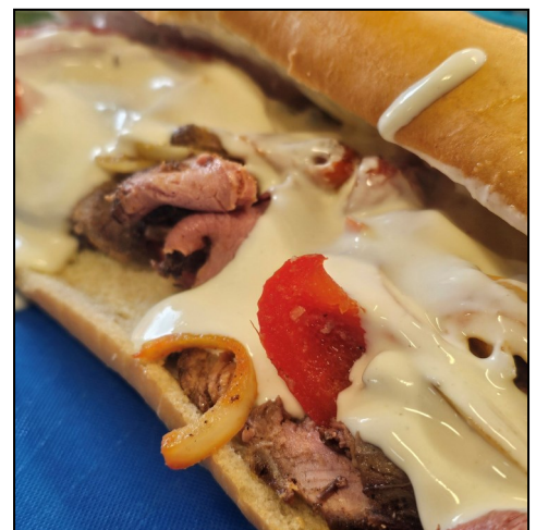
A hot sandwich is served on a cold day at the Soup and the Savior shed.

BOY, THIS Thanksgiving and Christmas season was busy. The Lord pro-