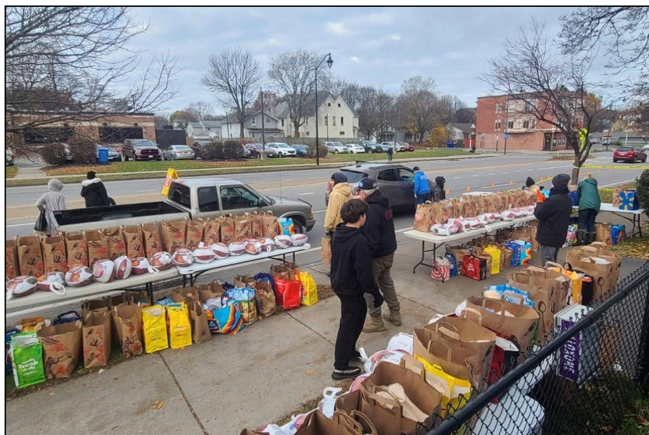
Turkeys and bags with all the fixings are ready for the Thanksgiving outreach.

THEN FOR Christmas we gave out close to 250 hams, chickens, and