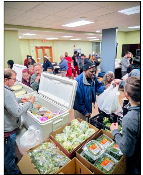
Fresh groceries are distributed at The Hamilton apartments on Mt. Hope Avenue.