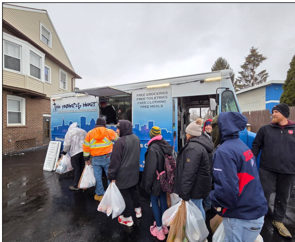
People loaded with bags of fresh groceries and bread line up on a frigid December morning to receive hot meals from the ministry's mobile kitchen.

Once there, click the "TFH Amazon Wishlist" button and shop for items that we use for our various outreaches! All items will be shipped directly to us and you will be billed through Amazon. Thank you in advance and may God bless you always!