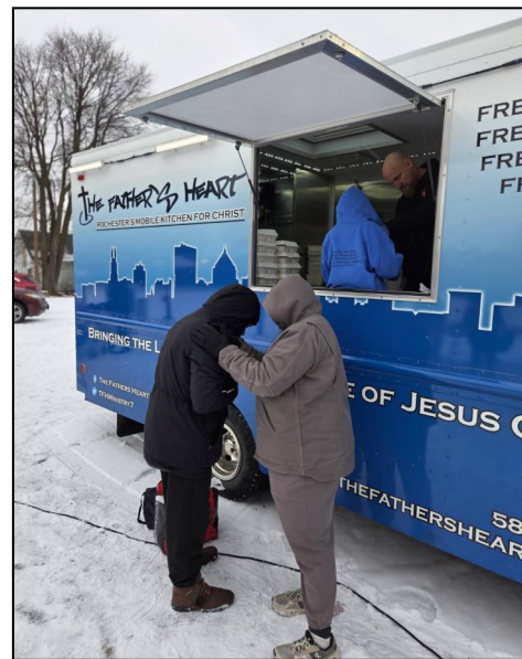
Prayer is a vital part of The Father's Heart ministry. At left and right, prayer on two separate Saturday outreaches at Lyell Avenue and Sherman Street.