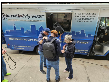
Two servants pray with a man.