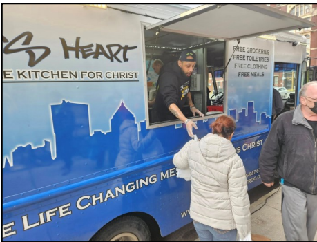
Above, a woman receives a hot meal at Andrews Terrace. At right, the clothing table on North Clinton.