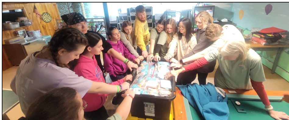
Teens from Flower City Work Camp ministry pray over the toiletry packs they made up for Redeeming Love to distribute to women on Rochester's streets.

led the van to her on the first Monday of March. He led and directed the van right to her.