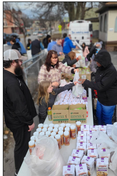
A family goes through the grocery line at a headquarters outreach.