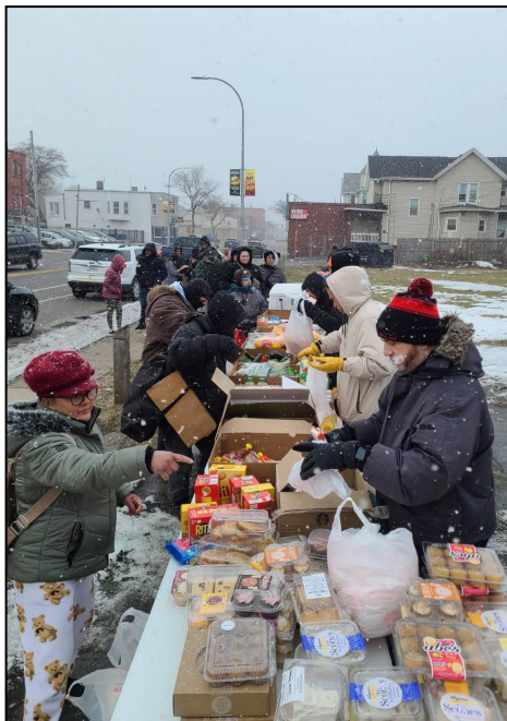
A snow flurry didn't stop the grocery line at an outreach on Lyell Avenue.