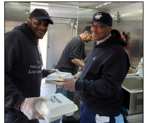
Brothers in the Lord serve hot meals from the mobile kitchen.

FROM JULY 16 through August 20 every Wednesday from 2 to 3 p.m. we will bring the food truck to Edgerton Community Center/Park to become the "Ice Cream Truck" for the kids in our community. It is here that you can serve ice cream, bring your youth group to