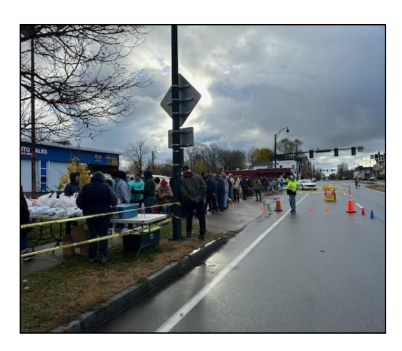
At left, Calvary Chapel Academy students supplied and helped pack Christmas food bags. Above, the food line for the Thanksgiving outreach is nearly ready for drivers.