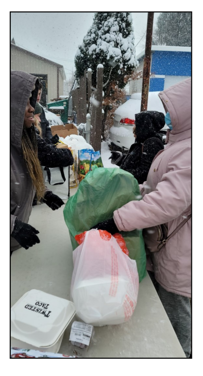
A servant's warm smile helps overcome a cold morning at the Christmas outreach.

Isaiah 6:8: Also I heard the voice of the Lord, saying, "Whom shall I send, and who will go for us?" Then I said, "Here am I; send me."