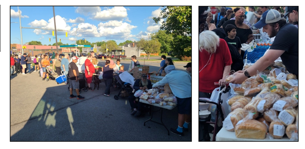
At left, the grocery line winds around the corner at West Main and Brown. At right, a servant helps a woman with her choices at Pinnacle Place apartments.

WHEN THE girls call out to other girls who are in a house, one by one the women come out. When we see their faces change before us we