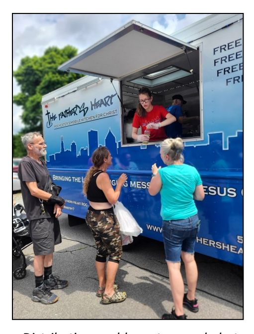
Distributing cold water and hot meals at Lyell and Sherman.