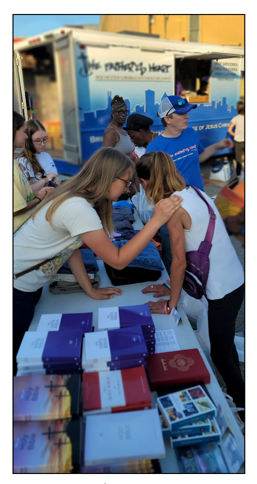
A servant reaches out in prayer to a woman in need at the table for Bibles and clothing at Lyell and Sherman.

God Speaks Through the City Part 63: Romans 15:13 By a servant in Christ