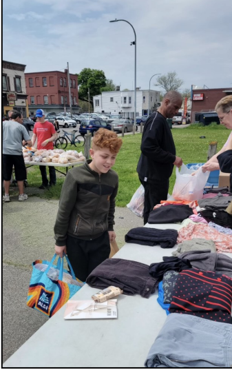
Clockwise from top left: A boy searches for clothes, the line for groceries, and servants are ready to distribute food.