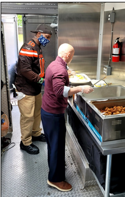
Servants prepare hot meals to go.

To further encourage Aiyden, I checked out a bin full of books and pamphlets, finding a children's