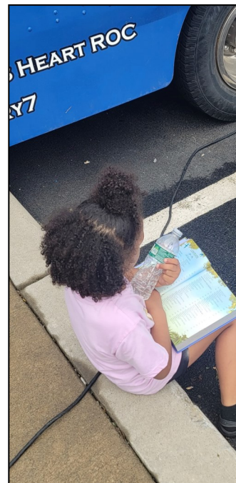
A young girl begins reading a Bible she received at an outreach on Cleveland Street.

Isaiah 6:8: Also I heard the voice of the Lord, saying, "Whom shall I send, and who will go for us?" Then I said, "Here am I; send me."