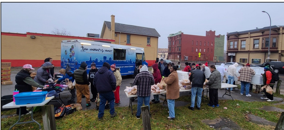
The gospel, prayer, hot food, groceries, and clothes are offered at every outreach.

To donate to The Father's Heart through PayPal, please go to thefathersheartoc.org and click the "Contact/Donate" tab for the PayPal icon. If you want a receipt, include your address on the optional address line and a receipt will be prepared for you.