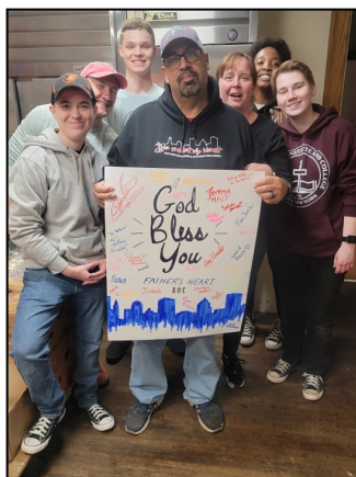
The sign says it all.