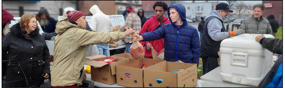
Fresh groceries are always popular at The Father's Heart outreaches.

We need many miracles to happen in the lives of those we encounter on the streets. We want