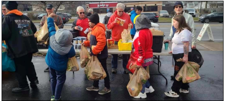
Servants fill bags with various food items.

Amazon has ended its AmazonSmile program, which benefitted the ministry. Many thanks to those who used AmazonSmile to donate to the ministry. We ask that you prayerfully consider donating through Amazon Wishlist.