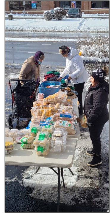
Bread and clothes are laid out on a cold, snowy day.

Isaiah 6:8: Also I heard the voice of the Lord, saying, "Whom shall I send, and who will go for us?" Then I said, "Here am I; send me."