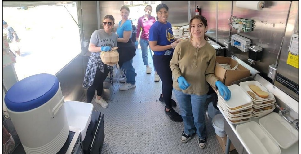
Volunteers package and serve hot meals on Thurston Road.

Redeeming Love is a branch of The Father's Heart ministry that focuses on addicted and/or exploited women on the streets of Rochester.