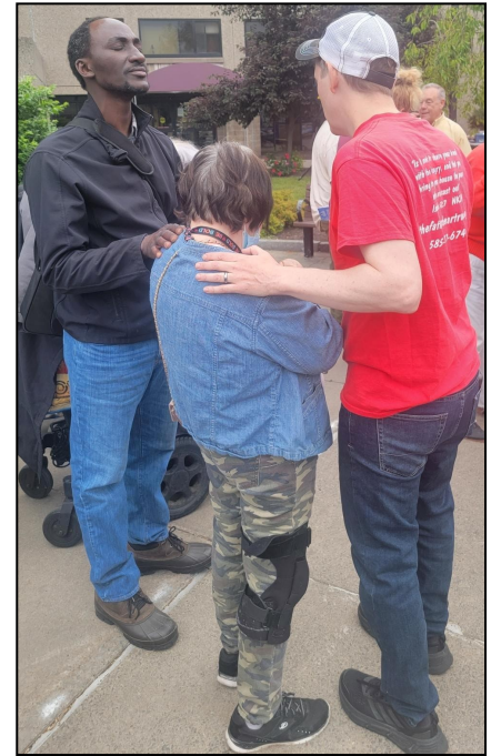
Servants pray with a woman at Pinnacle Place apartments.

Isaiah 6:8: Also I heard the voice of the Lord, saying, "Whom shall I send, and who will go for us?" Then I said, "Here am I; send me."