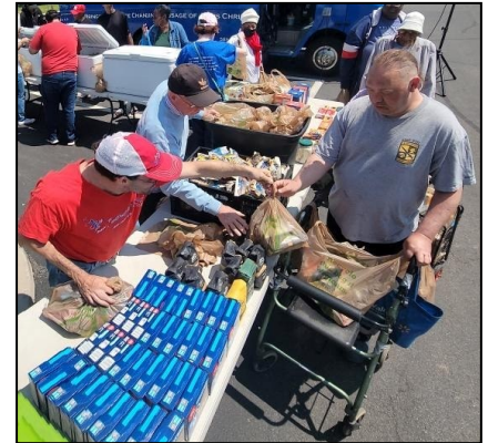
Bread at Lyell and Sherman.

1 CORINTHIANS 9:24-25: "Do you not know that those who run in a race all run, but one receives the prize? Run in such a way that you may obtain it. And everyone who competes for the prize is temperate in all things. Now they do it to obtain a perishable crown, but we for an imperishable crown."