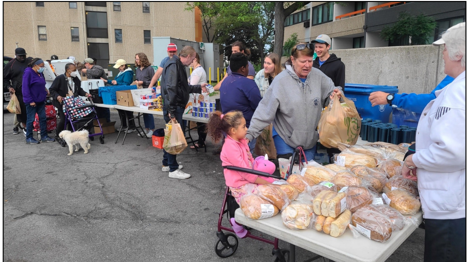
The groceries line at Southeast Towers II and The Savannah.

After she left, I noticed noise and turmoil down the sidewalk close to