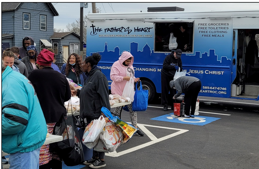
Above, groceries and hot food are available at the new Cleveland Street site. At right, the long grocery line at the outreach location.

Unless noted otherwise, all scripture in the newsletter is from the New King James Version.