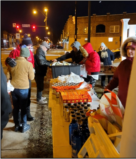
It was a cold night on Chili Avenue.