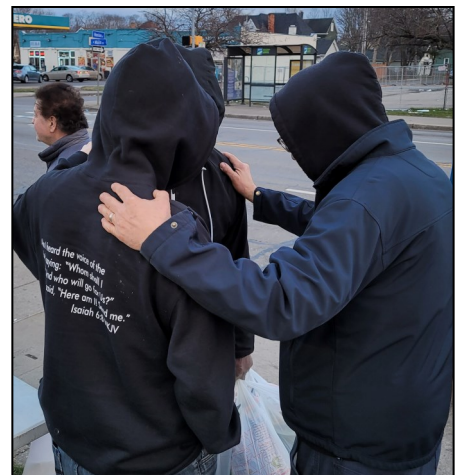
A time for prayer on Brown Street.