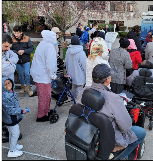
The line at Pinnacle Place apartments forms outside the food truck for hot, nutritious meals distributed by a friendly crew of volunteer servants.