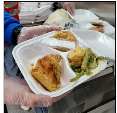
A hot meal is served at the new Cleveland Street outreach site.

WE ALSO have started a new outreach location on the fourth Saturday of the month on Cleveland Street. The first outreach there brought out many, and they heard about Jesus. What a blessing it was, and we are looking forward to what