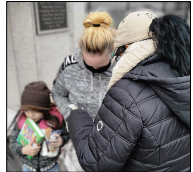
A little girl clutches her new children's Bible while a servant prays with her mother on Brown Street.

Isaiah 6:8: Also I heard the voice of the Lord, saying, "Whom shall I send, and who will go for us?" Then I said, "Here am I; send me."