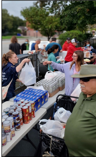
The grocery line on Lake Avenue.

FINALLY, SHE said: "We African... Why Jesus?" She pointed at herself and her son while she seemed to say, "Know Jesus, know Jesus." I