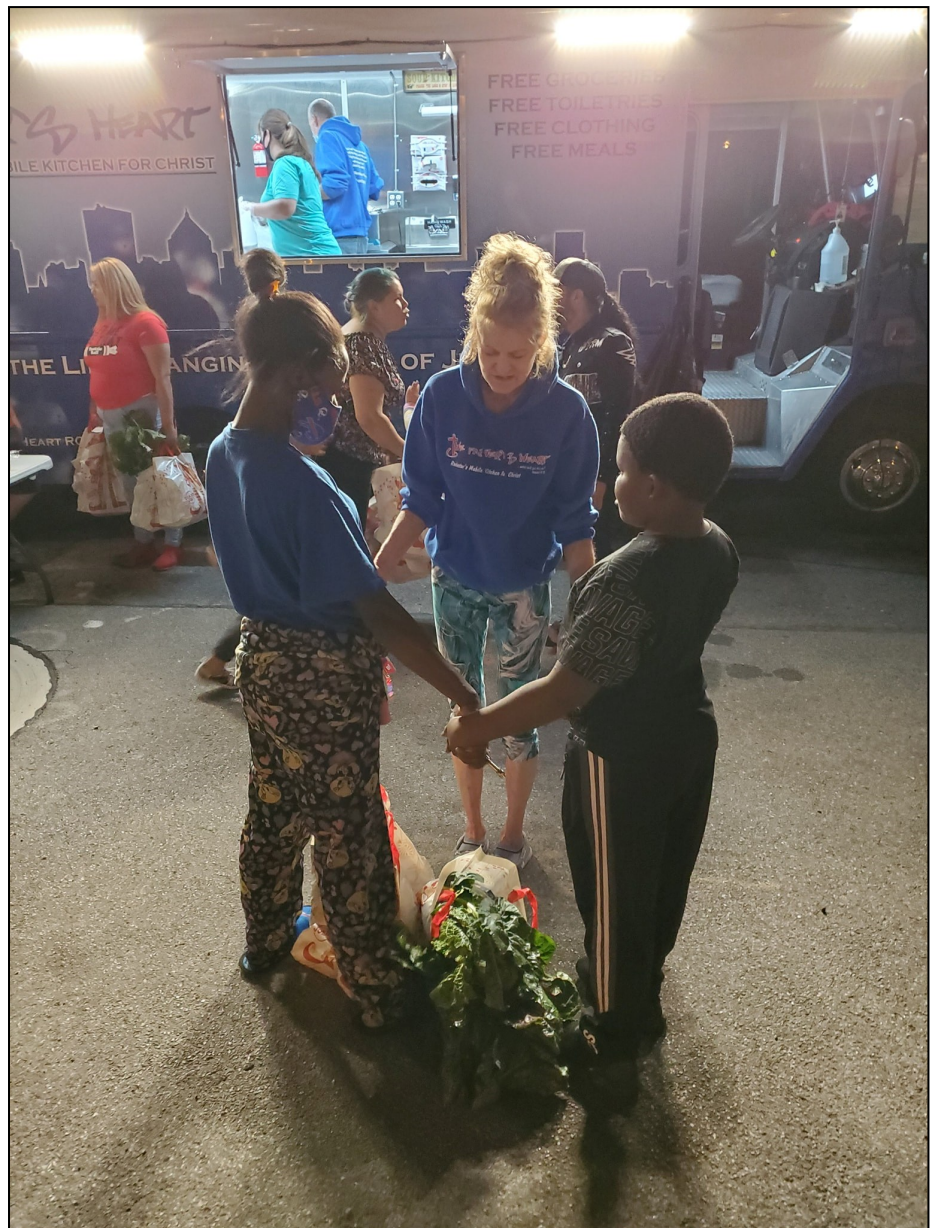
A servant prays with a mother and her son during at outreach at The Savannah and Southeast Towers II housing complex in Rochester.