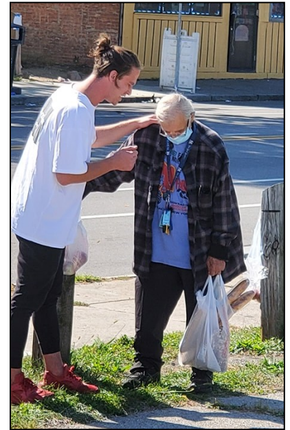
Prayer on Lyell Avenue.

Isaiah 6:8: Also I heard the voice of the Lord, saying, "Whom shall I send, and who will go for us?" Then I said, "Here am I; send me."