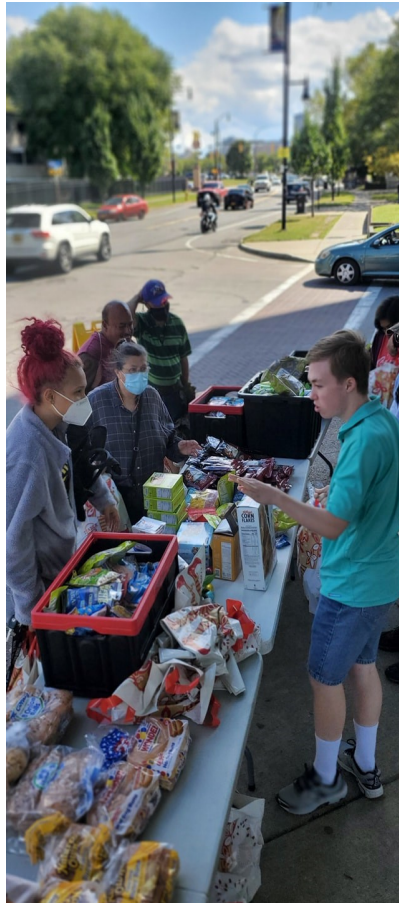
Left: Serving a hot meal at Lyell and Sherman. Right: The grocery line at North Clinton and Oakman.