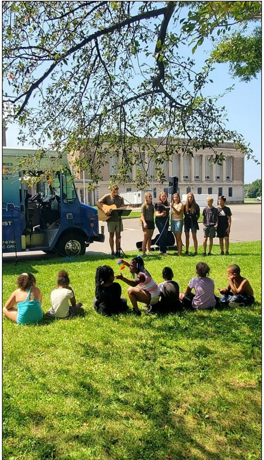
Above, kids listen to worship music at an Edgerton Park outreach. At left, kids line up for ice cream sundaes after receiving back backs loaded with school supplies.