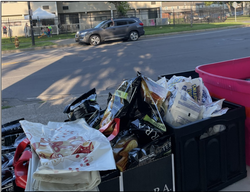
A tearful man in a van across the street raises his arm in prayer.