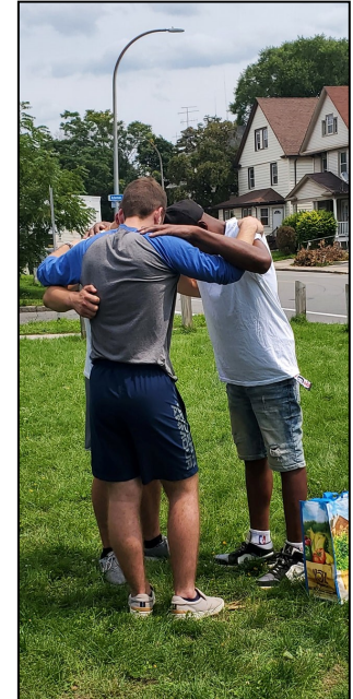
Prayer at Webster Avenue and Ackerman Street.

Isaiah 6:8: Also I heard the voice of the Lord, saying, "Whom shall I send, and who will go for Us?" Then I said, "Here am I; send me."