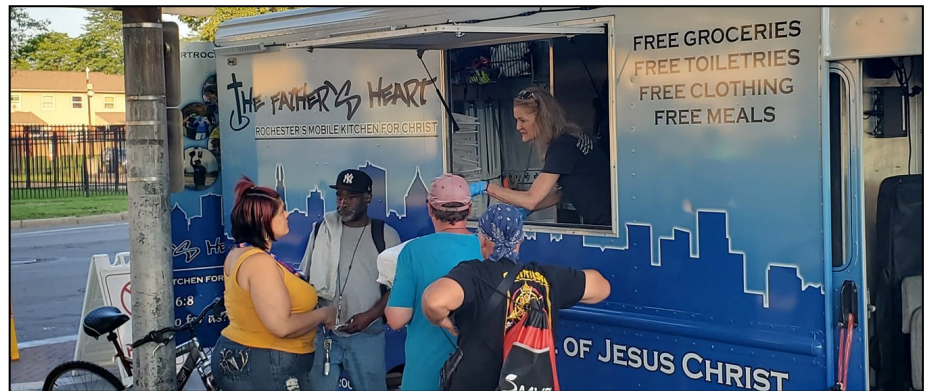
Hot meals are served at North Clinton and Oakman.

thew 11:15, "He who has ears to hear, let him hear!"