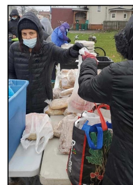
A volunteer distributes baked goods to a person in need on Lyell Avenue.