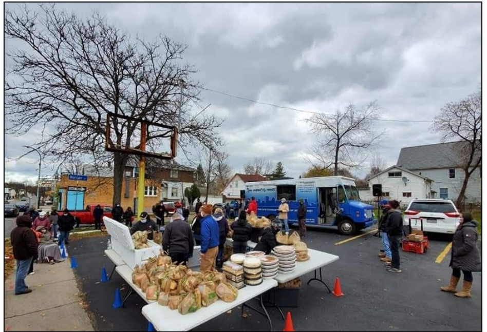
Menacing clouds on Hudson Avenue don't stop an outreach before Thanksgiving.

reverence and awe for Him. This type of fear drives us to respect God as our Father, encouraging our submission to Him as His children.