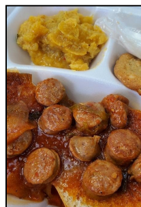
A hot meal made from scratch and served with love.