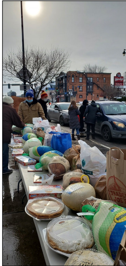
Food ready for distribution.

AS WE prayed some were moved to tears; it was evident that God was working on their hearts and dealing with their struggles in those moments.