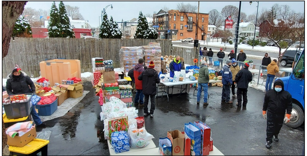
As a line forms down Lake Avenue, volunteers for the Christmas outreach distribute turkeys, gifts, hot homemade meals and the love of Jesus to those in need.

Through AmazonSmile, The Father's Heart receives a donation from Amazon of 0.5 percent of your purchase price, at no cost to you. To sign up, go to smile.amazon.com on your computer or mobile device. On your first visit, you will be asked to select a charity. Enter "Fathers Heart Ministry Roc Inc" in the box that says "Or pick your own charitable organization." You'll be directed to the Amazon website for shopping as usual.