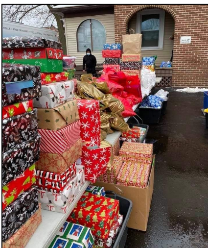
Presents prepared for giving.

I HAD the privilege of praying for people along with my father-in-law while they were standing in line waiting to pick up food and Christmas gifts. We had the opportunity to hear the testimony of some who were believers continue to praise God for the ministry as well as praise God for his faithfulness even through their tremendous struggles.