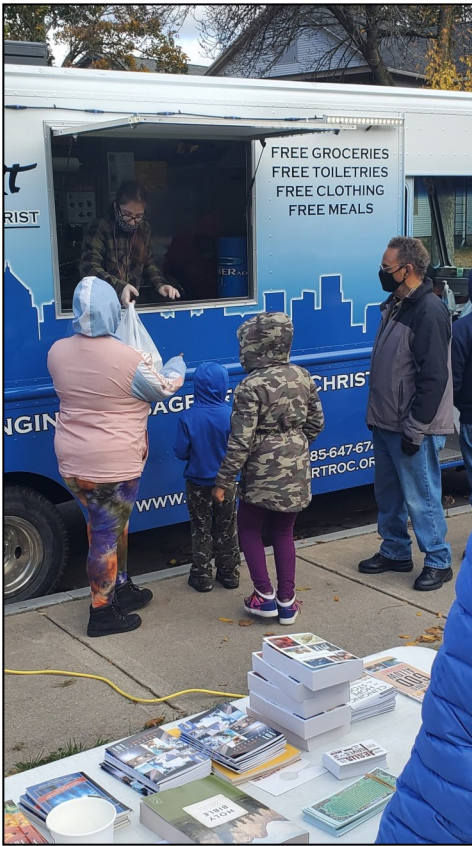
Food for the body and the soul.