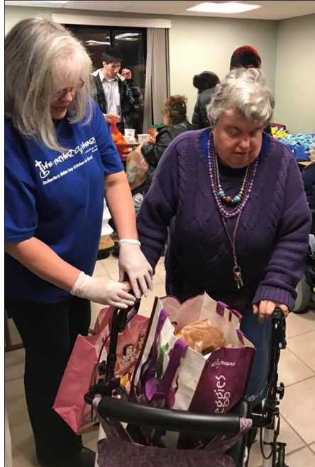
A resident of Pinnacle Place apartments is helped with a bag of food.

Through AmazonSmile, The Father's Heart receives a donation from Amazon of 0.5 percent of your purchase price, at no cost to you. To sign up, go to smile.amazon.com on your computer or mobile device. On your first visit, you will be asked to select a charity. Enter "Fathers Heart Ministry Roc Inc" in the box that says "Or pick your own charitable organization." You'll be directed to the Amazon website for shopping as usual.