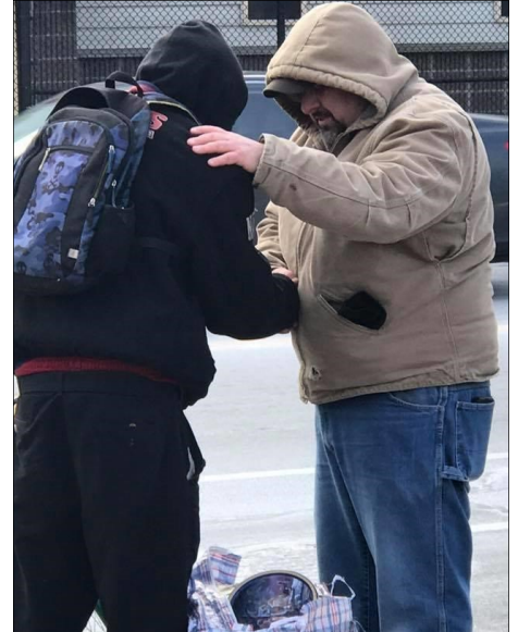
Praying at Lyell and Sherman.