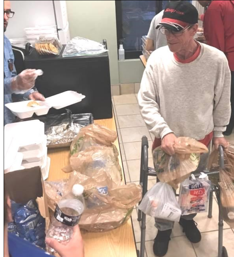
A hot meal is served at Pinnacle Place apartments in Rochester.

I THINK The Father's Heart is getting to be known more and more, as people ask when we are coming again. God is using The Father's Heart all over Rochester and He continues to bless the ministry. Our prayer is to see more people come to Christ and be saved.