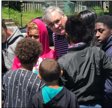
Servants from The Lamp Community Church share the good news.

Tickets will be available in September. Mark your calendar for Nov. 4 . You won't want to miss this event!