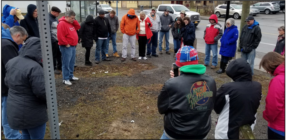
The third stop on the Prayer Walk was on Jefferson Avenue.

But what did we pray for the most? We prayed for the salvation