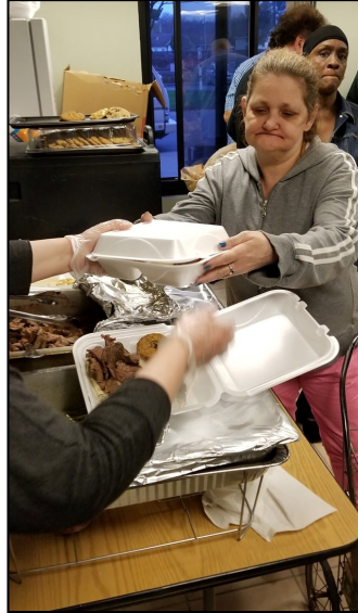
A hot meal is served at Pinnacle Place.

Through AmazonSmile, The Father's Heart receives a donation from Amazon of 0.5 percent of your purchase price, at no cost to you. To sign up, go to smile.amazon.com on your computer or mobile device. On your first visit, you will be asked to select a charity. Enter "Fathers Heart Ministry Roc Inc" in the box that says "Or pick your own charitable organization." You'll be directed to the Amazon website for shopping as usual.