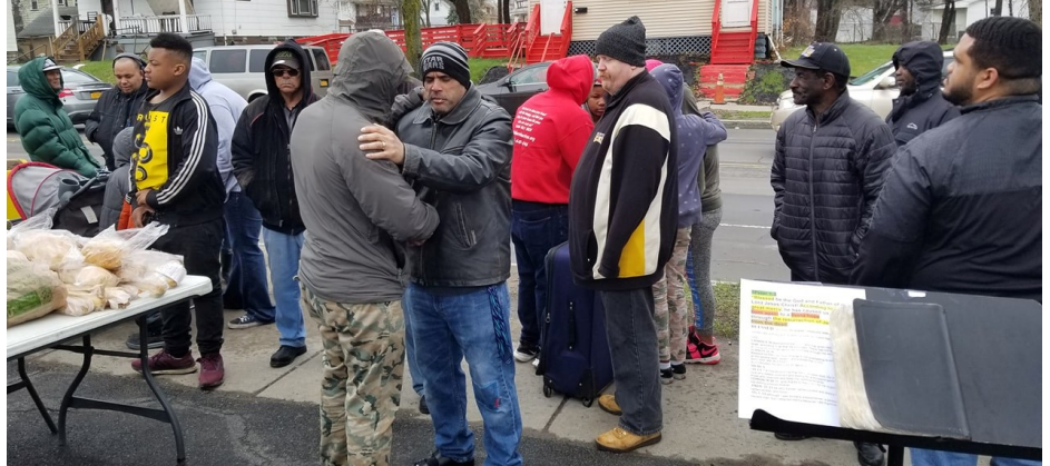
A servant offers prayer during the gospel message on Hudson Avenue.

Donations can be dropped off at The Father's Heart headquarters, 678 Lake Avenue, Wednesday through Friday from 12 noon to 5:30 p.m. For information, call (585) 472-4331.