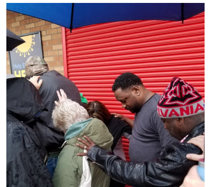
Praying in the rain.