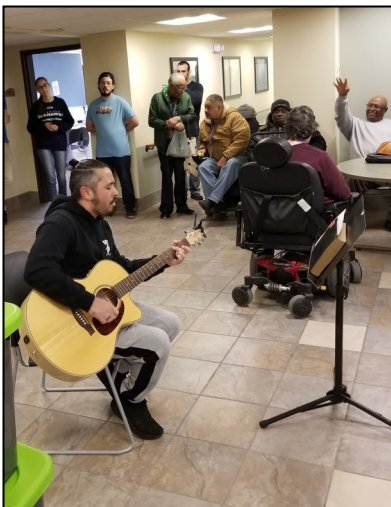
Worship at Pinnacle Place.