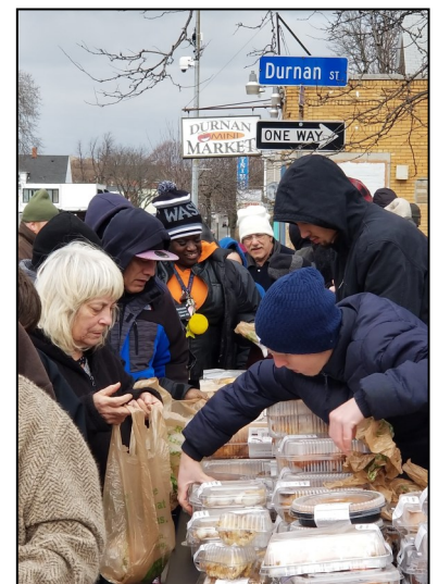
The food line on Hudson Avenue.