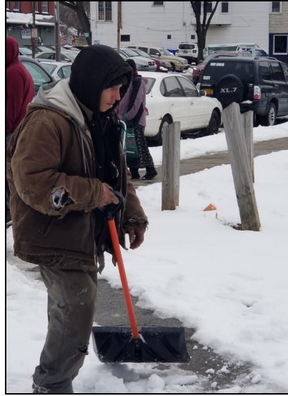
Without being asked, this young homeless man grabbed a shovel to clear snow at an outreach on Lyell Avenue.

ship with other servants and participate in the outreach. I then departed from the crowd seeking a place of solitude to pray and seek His guidance. A few people saw my grief but did not approach me.