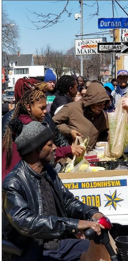
Those in need gather on Hudson.

Through AmazonSmile, The Father's Heart receives a donation from Amazon of 0.5 percent of your purchase price, at no cost to you. To sign up, go to smile.amazon.com on your computer or mobile device. On your first visit, you will be asked to select a charity. Enter "Fathers Heart Ministry Roc Inc" in the box that says "Or pick your own charitable organization." You'll be directed to the Amazon website for shopping as usual.