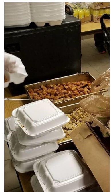
Hot meals are ready to go.