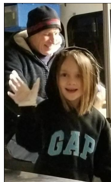
Volunteers stack incoming donations (left), conduct worship (above left), serve hot food (above right), and distribute groceries, clothing, and Bibles (below).