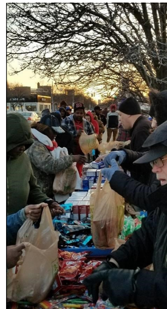
Evening falls on the grocery line.

Psalm 65:8: You make the outgoings of the morning and evening rejoice.