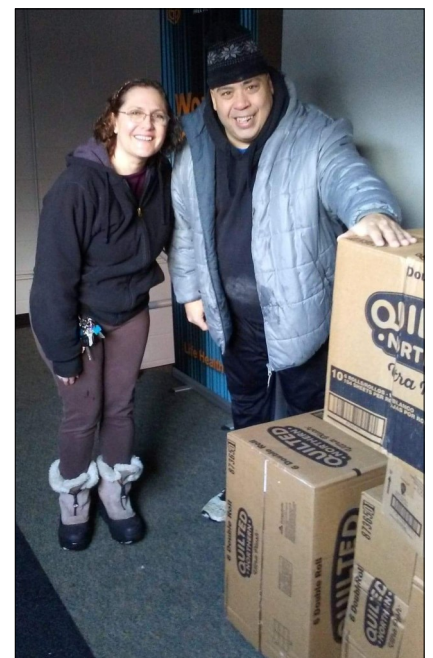
Toilet tissue and wipes are donated to Mothers In Need of Others of Rochester.