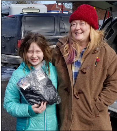
A young lady and her grandmother donate gloves in her late father's memory.