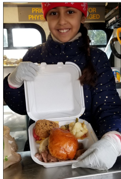
A young lady serves a delicious hot meal on a cold day.

Psalm 34:8: "Taste and see that the LORD is good."