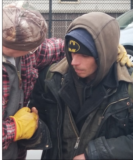
A priority at The Father's Heart is praying with those in need.

regularly see children being cared for by grandmothers or alone in the streets due to their parents' addiction, incarceration, or abandonment. Thank God that He views each one of us as His children, despite our upbringing and sins we may have committed following poor examples.