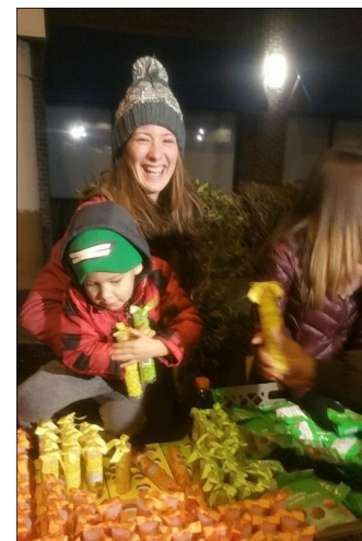
A young man helps Mom serve at Andrews Terrace.

Proverbs 22:6: Train up a child in the way he should go, and when he is old he will not depart from it.