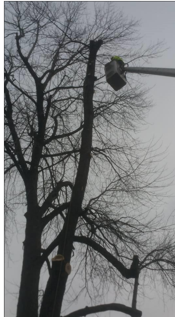
A tree is removed from the site where the barn will go.

To donate to The Father's Heart ministry through PayPal, go to thefathersheartroc.org , click on the contact/donate tab, and scroll down to the PayPal icon. Thank you!