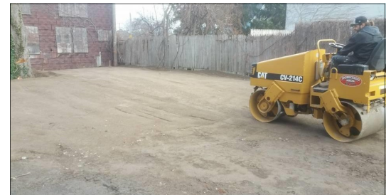
The fill is rolled for a firmly packed base.