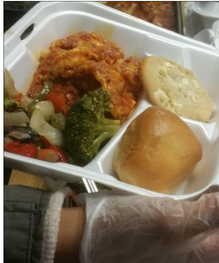
A hot meal is served.

Through AmazonSmile, The Father's Heart receives a donation from Amazon of 0.5 percent of your purchase price, at no cost to you. To sign up, go to smile.amazon.com on your computer or mobile device. On your first visit, you will be asked to select a charity. Enter "Fathers Heart Ministry Roc Inc" in the box that says "Or pick your own charitable organization." You'll then be directed to the Amazon website for shopping as usual.