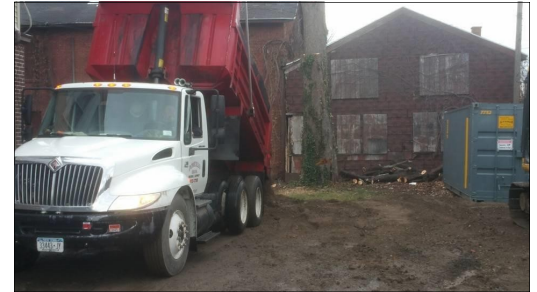
Trucks of fill and gravel are brought in to raise the lot's grade.

To see the construction in order, start at upper left and go clockwise.