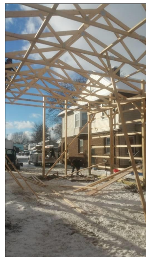
The posts are connected and roof trusses are set into place.