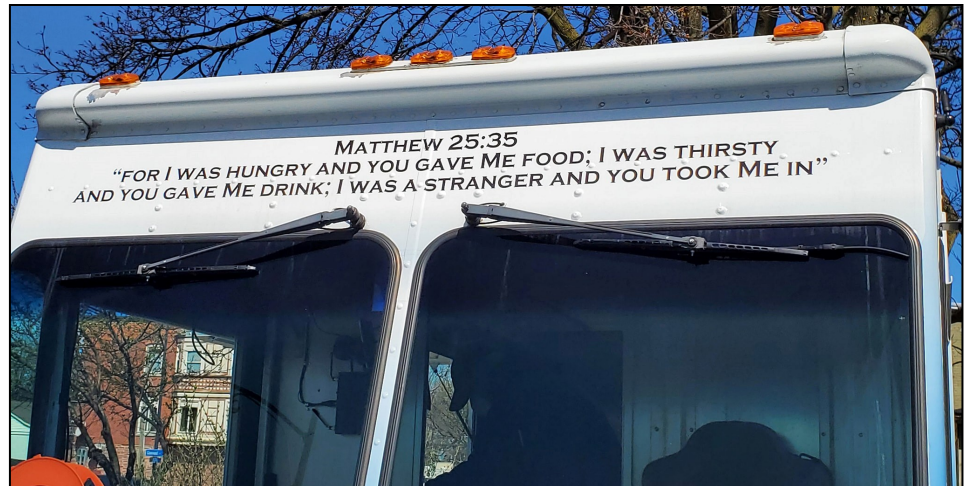
More than words on the food truck: what the ministry is all about.

WE PRAY and know that the Lord has many things in store for The Father's Heart ministry. There are many who still need to know that Jesus is the Savior of world, that He came to heal the broken-hearted, He came to set the captives free, He is on the throne, He