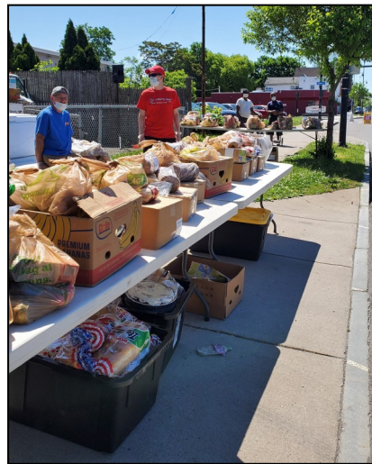
Food ready for distribution.