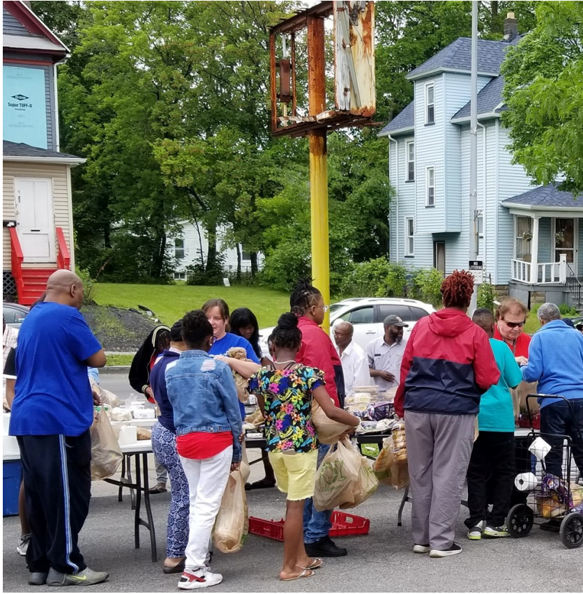
Groceries and household goods are available on Hudson Avenue.