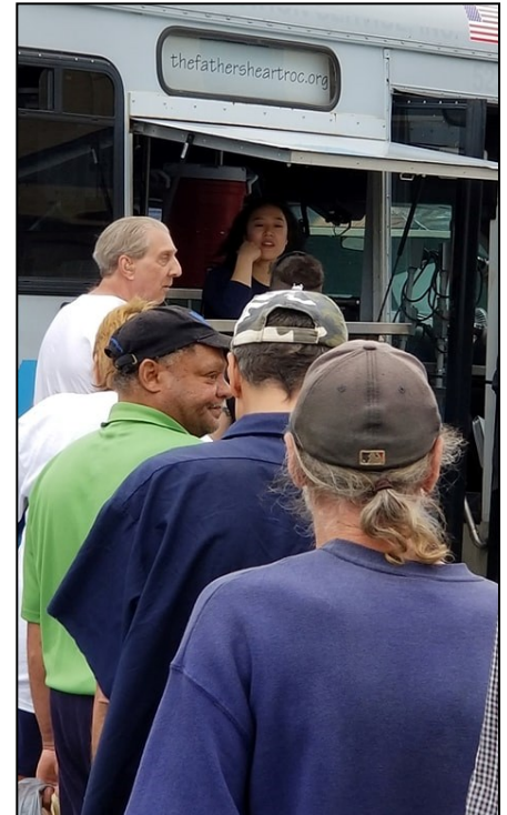
People wait in the hot food line .

"I want to send these pictures to strong supporters of the (Communist) revolution that believe lies about America. They believe Americans are selfish, racist,