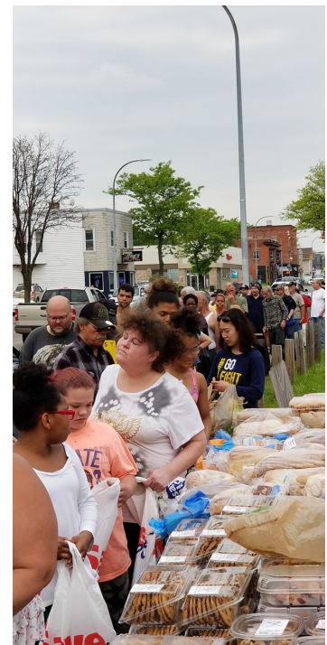
The grocery line at an outreach on Lyell Avenue.

EPHESIANS 5:8-14: "For you were once darkness, but now you are light in the Lord. Walk as children of light (for the fruit of the Spirit is in all goodness, righteousness, and truth), finding out what is acceptable to the Lord. And have no fellowship with the unfruitful works of darkness, but rather expose them. For it is shameful even to speak of those things which are done by them in secret. But all things that are exposed are made manifest by the light, for whatever makes manifest is light. Therefore, He says: 'Awake, you who sleep, arise from the dead, and Christ will give you light.' "