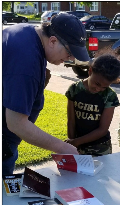
A volunteer helps a young lady choose a Bible in Geneva.

struggling with depression and had just taken medicine for it so she was a little out of it.