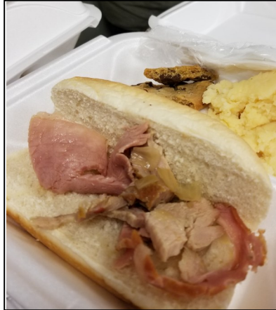
A hot meal is ready for serving at Pinnacle Place apartments.

Donations can be dropped off at The Father's Heart headquarters, 678 Lake Avenue, Wednesday through Friday from 12 noon to 5:30 p.m. For information, call (585) 472-4331.