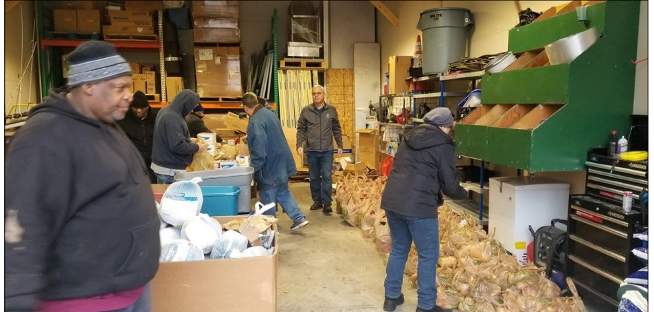
Bags of frozen turkeys are piled high before distribution at an outreach.

At this time of year, many families are seeking warm winter clothing. Above left, a little girl watches as her family looks for clothes. Above right, a servant helps a woman in need at the clothing table.