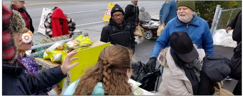
Servants distribute groceries during an outreach before Thanksgiving.

Through AmazonSmile, The Father's Heart receives a donation from Amazon of 0.5 percent of your purchase price, at no cost to you. To sign up, go to smile.amazon.com on your computer or mobile device. On your first visit, you will be asked to select a charity. Enter "Fathers Heart Ministry Roc Inc" in the box that says "Or pick your own charitable organization." You'll be directed to the Amazon website for shopping as usual.