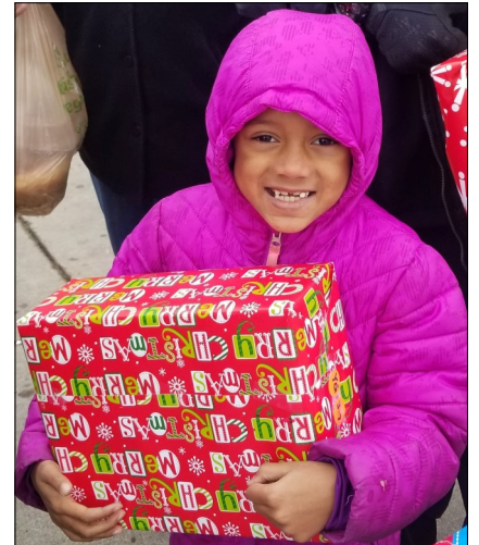
A child receives a donated Christmas gift at an outreach.

Psalm 127:3: Children are a heritage from the LORD.