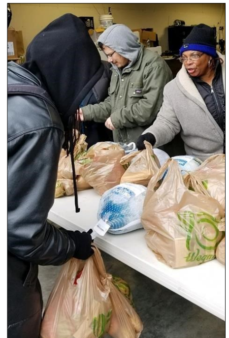
Servants distribute frozen turkeys to those in need.