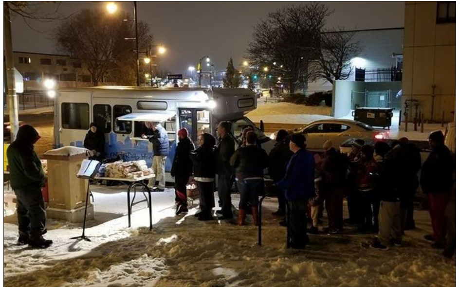
The gospel is preached at Clinton and Oakman three days before Christmas.