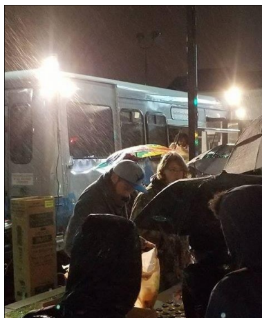
Despite cold, wind-blown rain, an outreach goes on at Brown and West Main streets.

Matthew 7:25: And the rain descended, and the floods came, and the winds blew, and beat upon that house; and it fell not: for it was founded upon a rock.