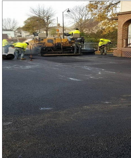
The new, donated parking lot.