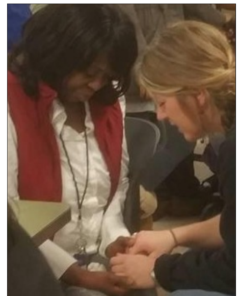
Joining in prayer at Pinnacle Place.