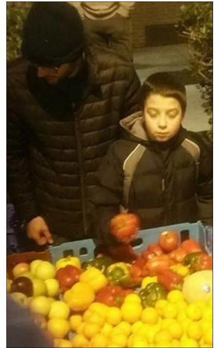
Free food at Andrews Terrace.

Isaiah 6:8: Also I heard the voice of the Lord, saying, "Whom shall I send, and who will go for Us?" Then I said, "Here am I; send me."