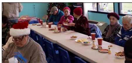
Christmas party at Pines of Perinton.