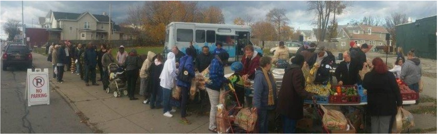
Servants distribute food as storm clouds gather in the west during an outreach at Lyell Avenue and Sherman Street.